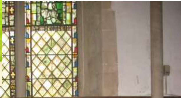
British Life and Culture class visit Oxford, England