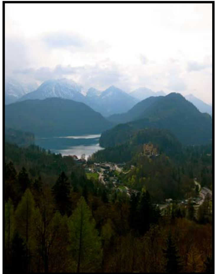
2ND PLACE: GREG ZAVITZ