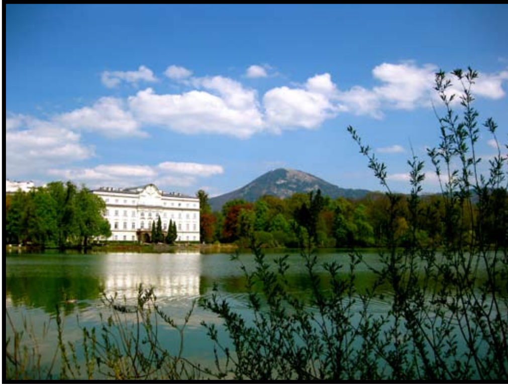
1ST PLACE: CLAIRE LIANG