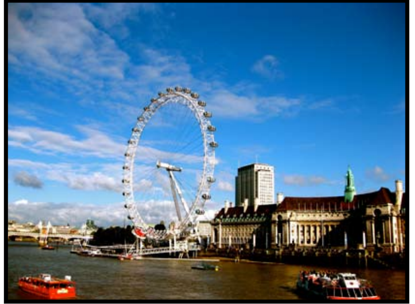
3RD PLACE: GREG ZAVITZ