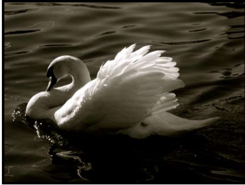
1ST PLACE: GREG ZAVITZ