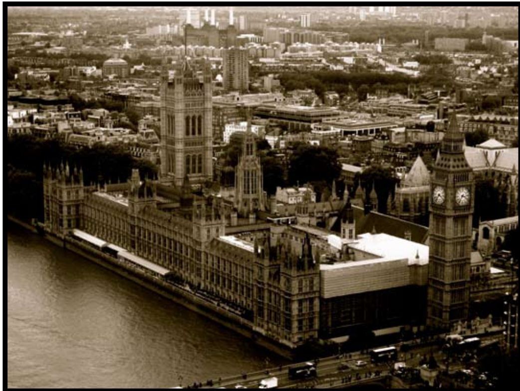
2ND PLACE: CLAIRE LIANG