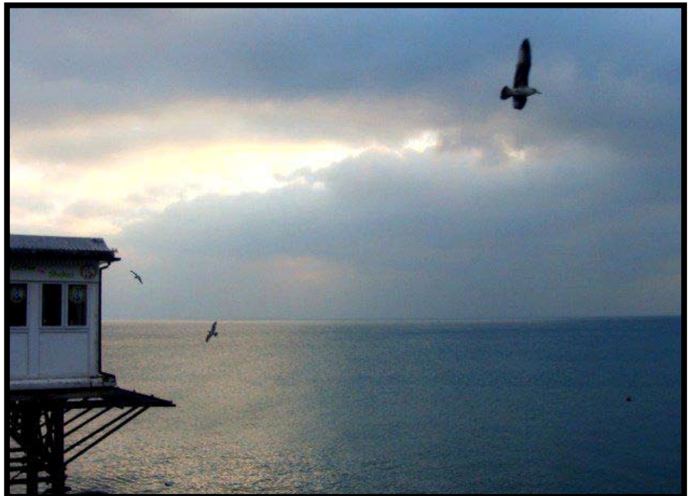
3RD PLACE: ELLE LUCKSTED