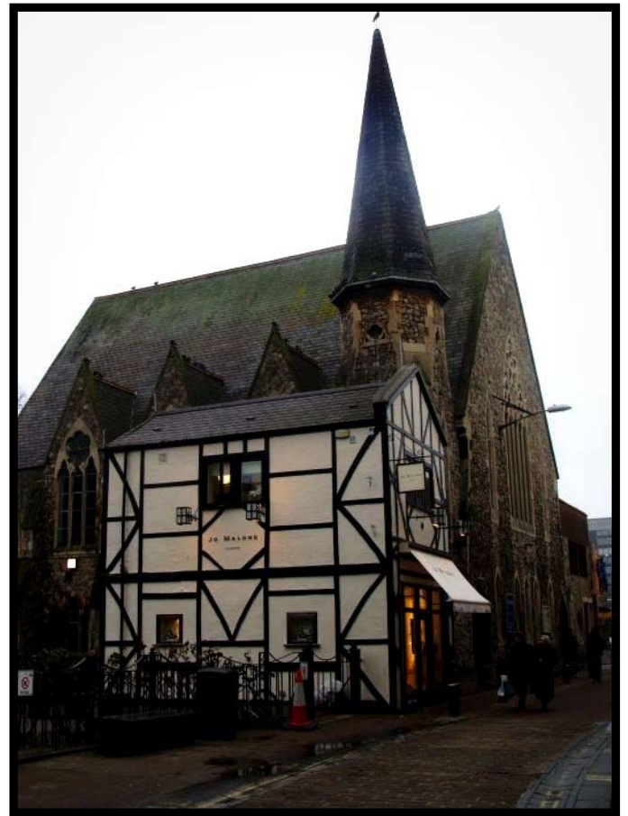
2ND PLACE: ELLE LUCKSTED