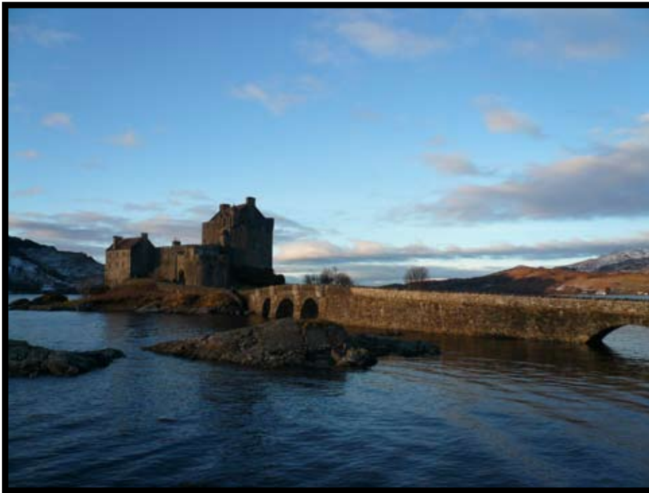
2ND PLACE: KATIE WINNEWISSER